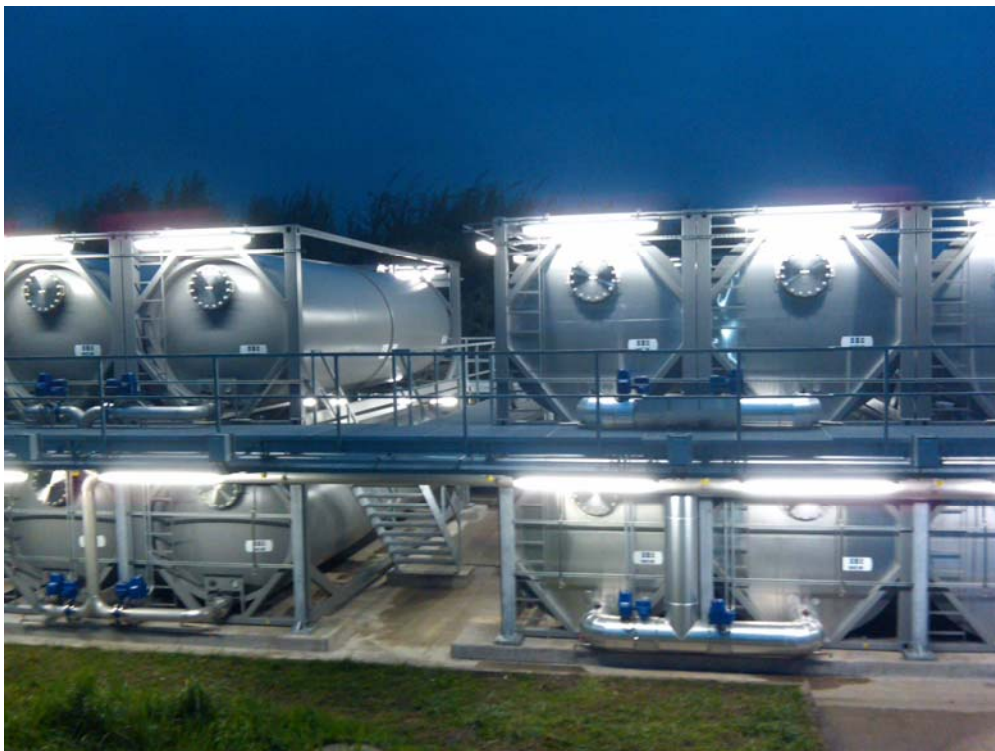
View of aircraft deicing fluid storage tank farm